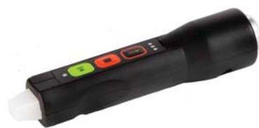
Pencil Probe - Straight