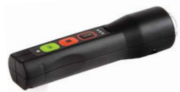
Pencil Probe - 90° Transverse