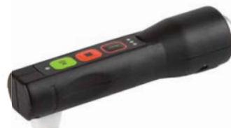
Pencil Probe - 90° Inline